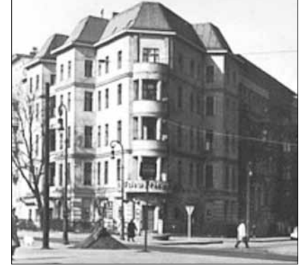
Damages after the War