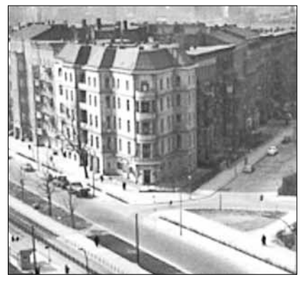
1961: no trees at the Yorckschlösschen