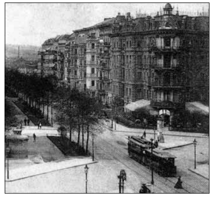
Yorckschlösschen with front garden ca. 1900