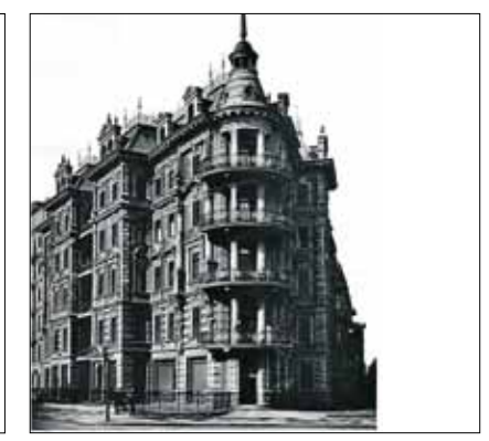
After completion 1890 without restauration