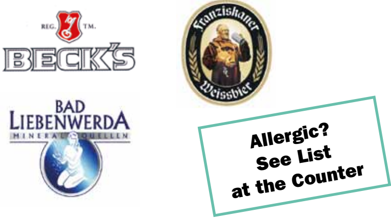
All prices in Euro with tax included.